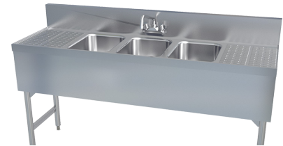
Multiple Well Sinks

For over 60 years, LaCrosse has been recognized by the food service industry for its quality equipment, quick delivery and modest pricing. Our flexibility and attention to detail ensure that you receive a piece of equipment that meets your specific needs, and our use of quality materials ensures that your equipment will last. Visit LacrosseCooler.com to see our full line of Underbar Equipment, or call your local Piper sales representative today.