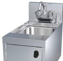
Standard Hand Sinks

A virtual sampling of Piper's LaCrosse Underbar Equipment. Take a look at what Piper can do for you!